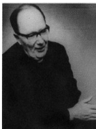
Lonergan lectures at Boston College in the 1970s.