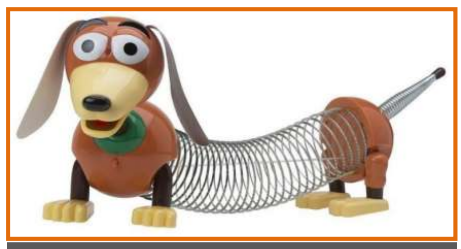
resilience may be experienced as springing back into the same shape

The dictionary defines the term resilience as the ability to spring back . Such an understanding implies buoyancy and elasticity. Such an understanding also implies the ability to spring back to the same shape. One example of springing back into the same shape is that of the slinky, a child's toy. A slinky is a long spring which can be pulled out to its full length and when let go it will spring back into its former shape. In a similar